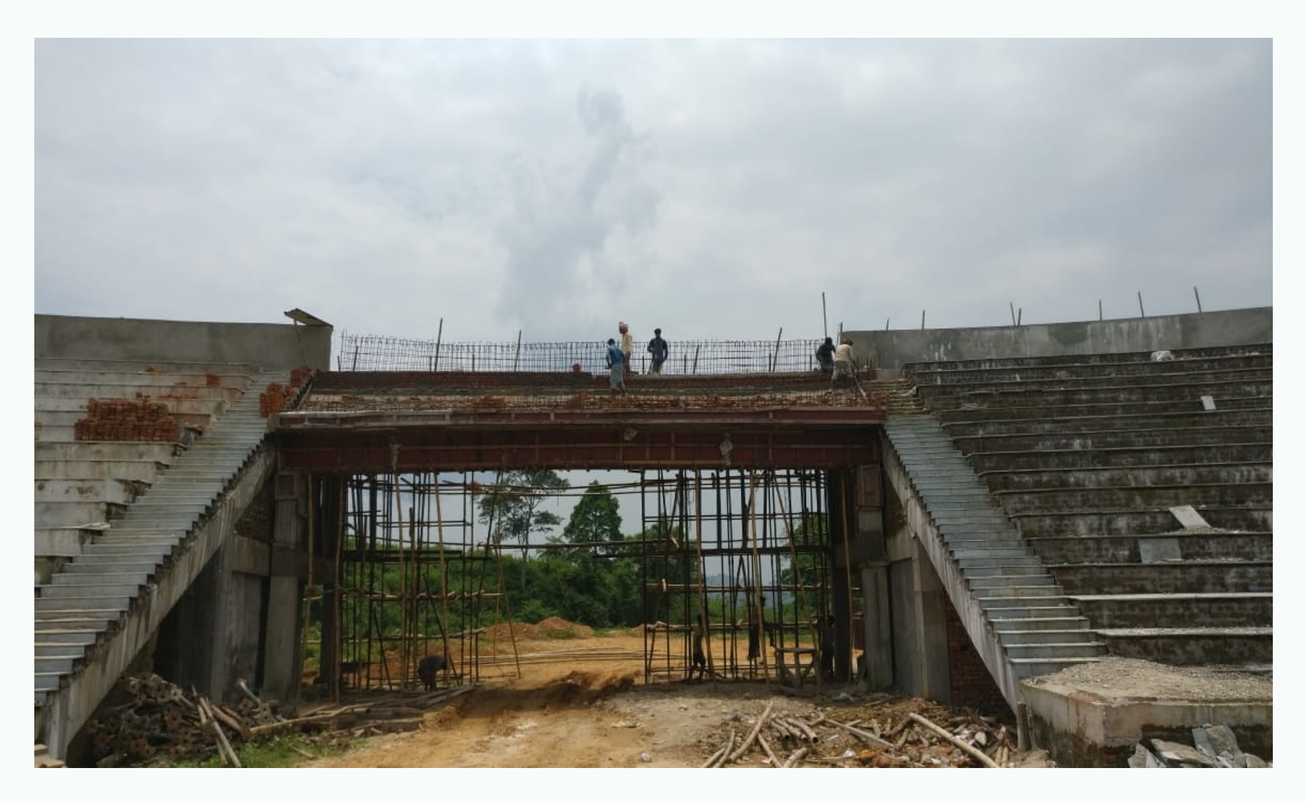
Connecting Block- A & B