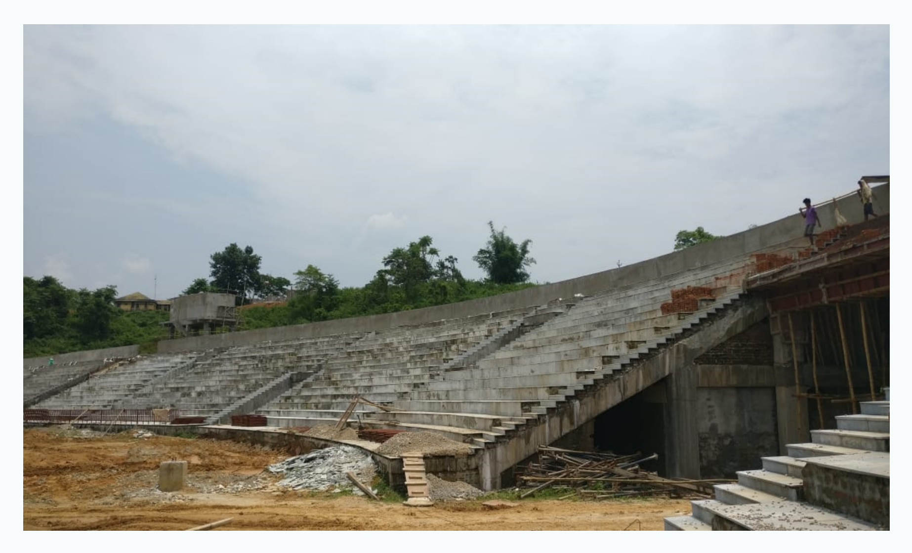
Block-B & C