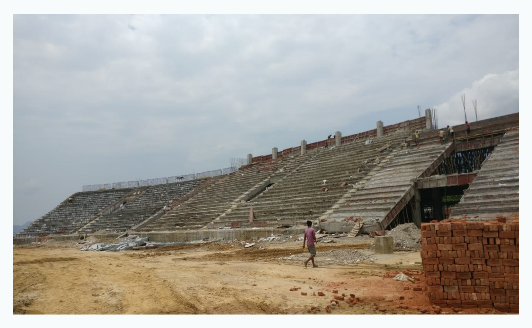
Block- E & F