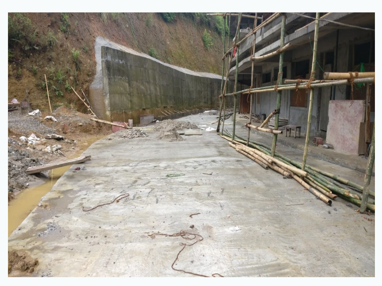
RCC Approach road behind Block- B