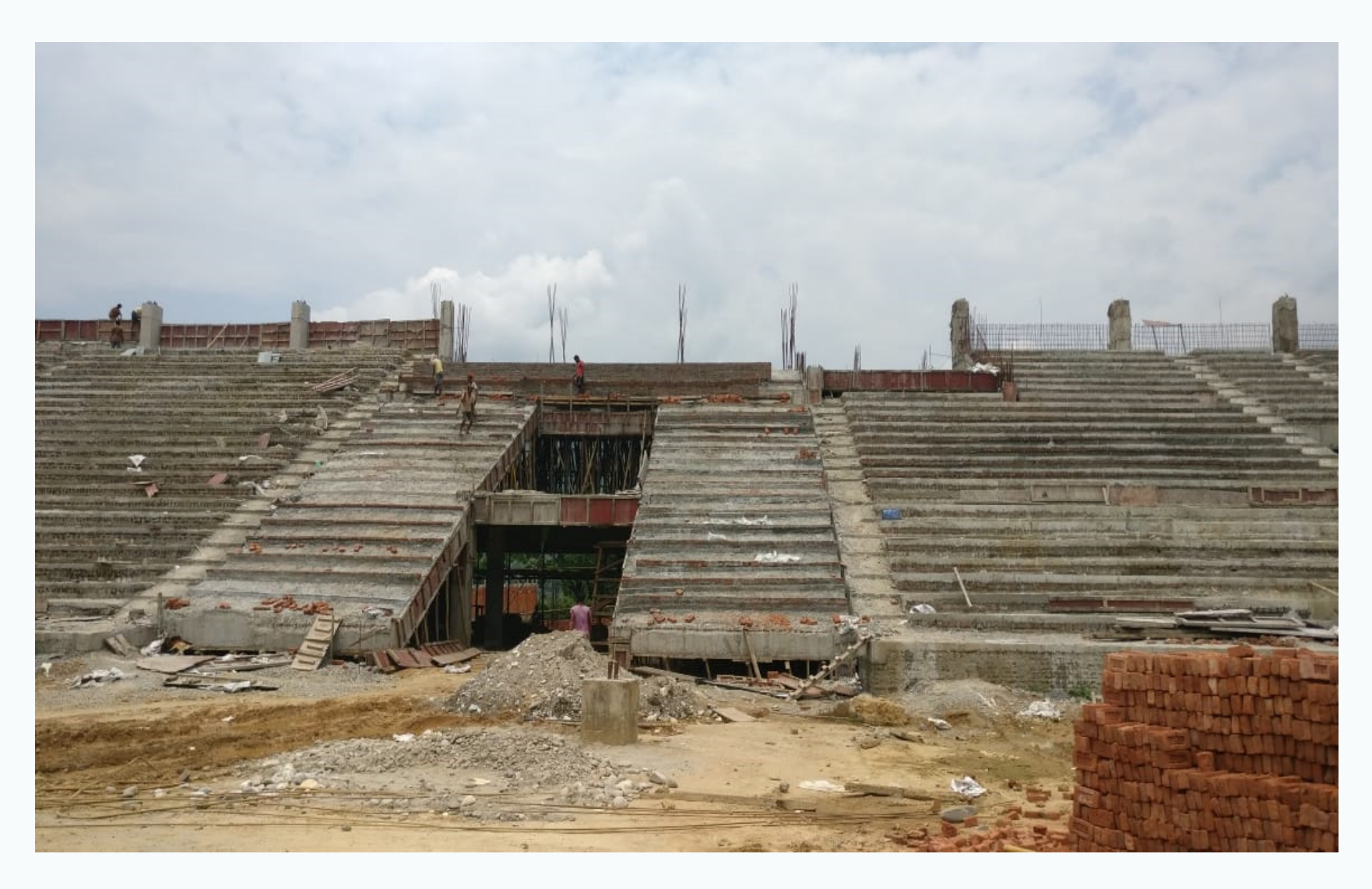
Connecting Block- E & F