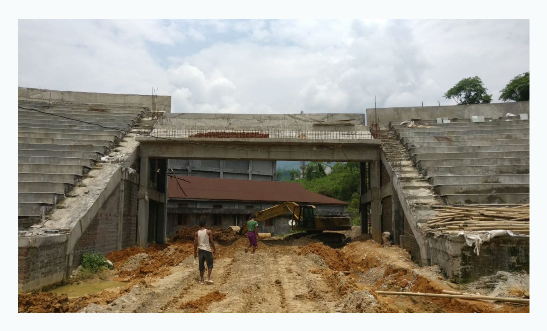
Connecting Block-E & F