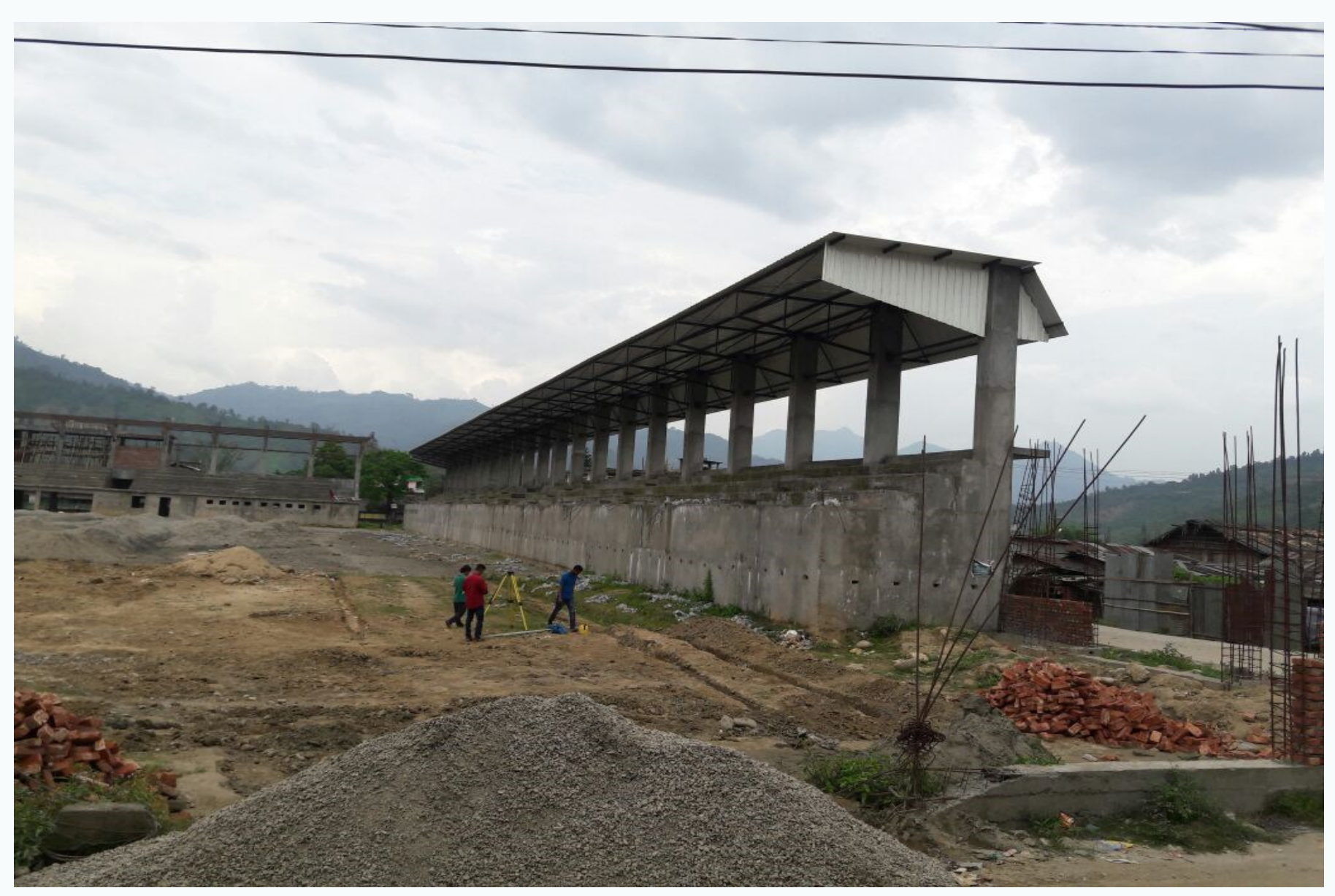
TIER= C= Fitting & Fixing of Dyna Roofing