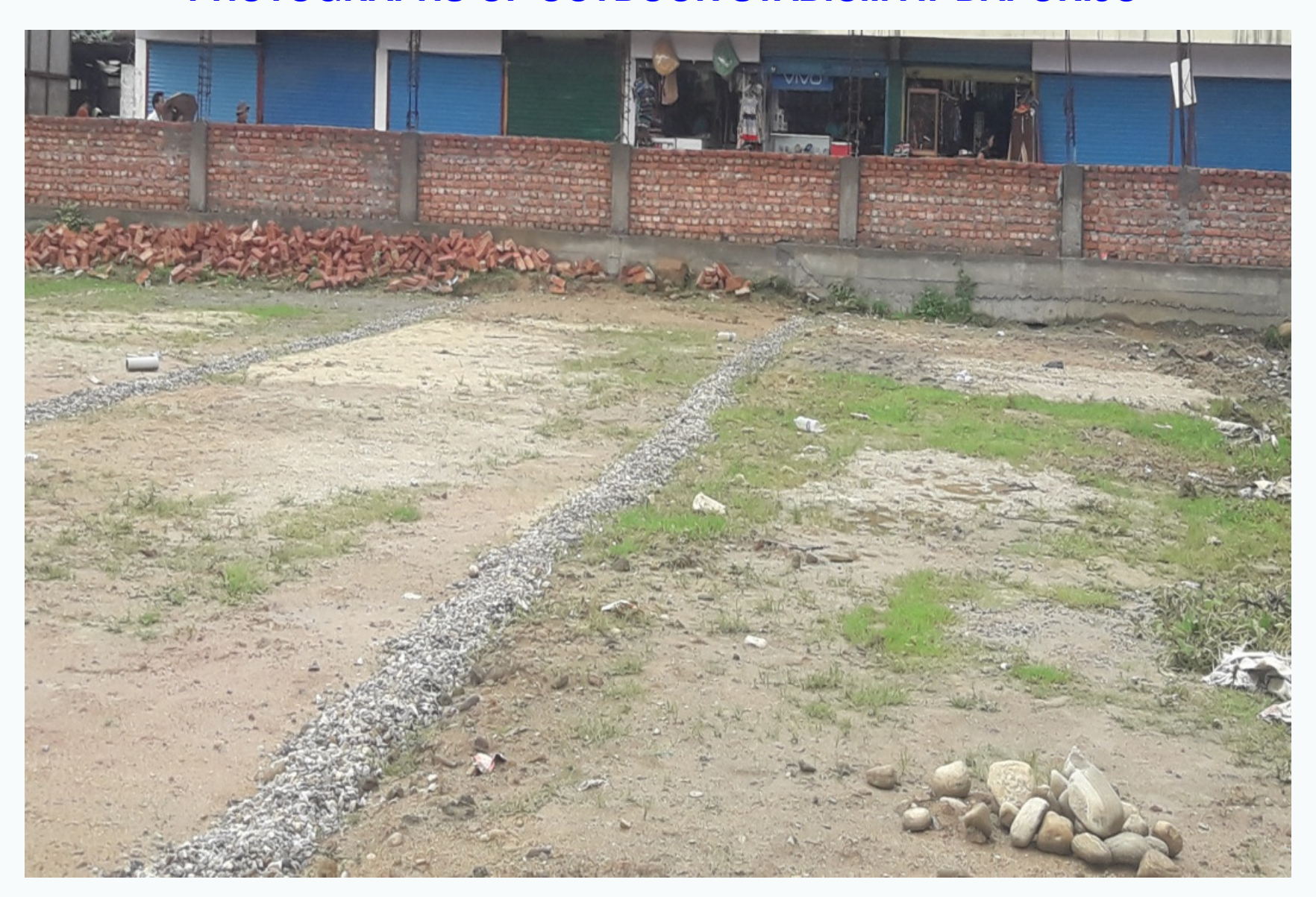
Boundary wall – work progress